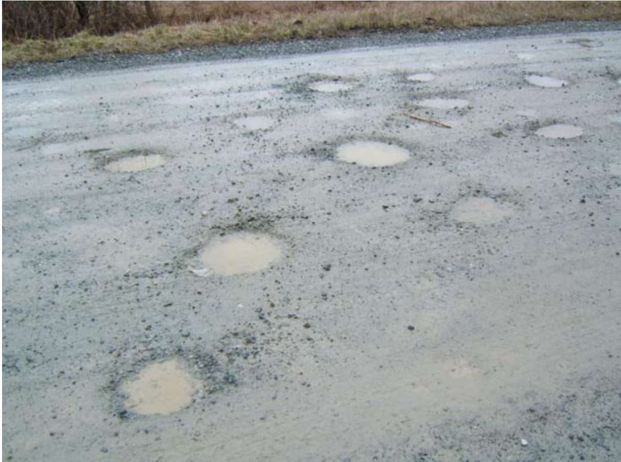
General view of the sampling site TEX-5 on Horseshoe Road, Gabriola (no, not a NASA planetary flyby photograph).