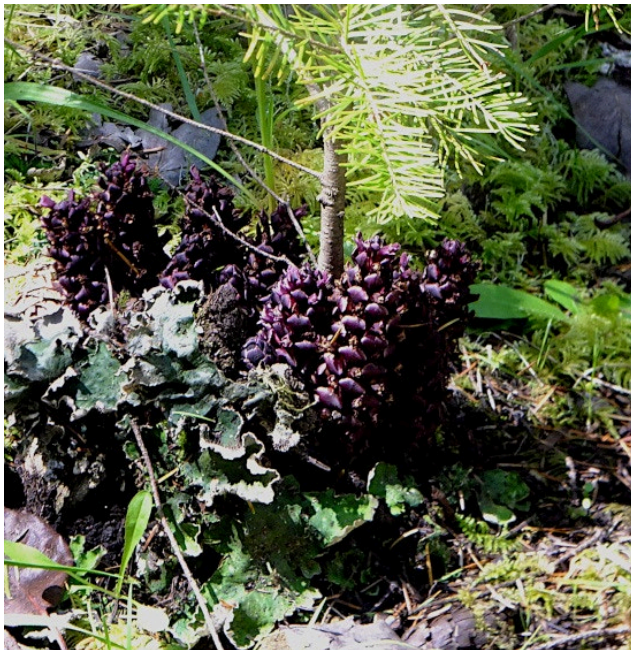
Collection of groundcones ( Boschniakia hookeri ). They're root-parasites of salal, but these appear to be working on a Doug.-fir sapling.